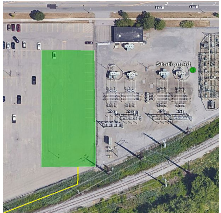
Planned route of new transmission line (L949) into Station 418 in the Town of Gates and into Station 48 in the City of Rochester.